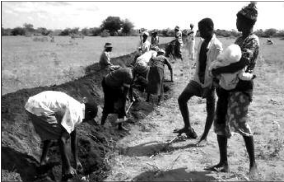
Contour ridge and infiltration pit under construction