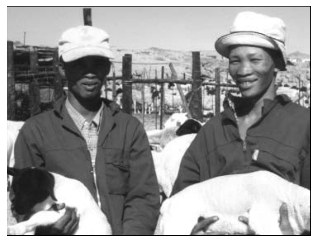
Witbank farmers, Northern Cape

These different factors combine to constrain the land reform programme in its current arrangement from making any significant impact on poverty reduction in the Northern Cape. If the government is unable to address these issues, the chances of the programme realising its objectives as well as creating a black commercial farming class looks remote. While reforming South Africa's land market is undoubtedly an important political objective, policies that seek to complement and develop poor people's assets especially their human capital through education and skills training helping them to compete more successfully in the labour market may prove to be more effective at achieving poverty reduction than land reform in areas that have similar socio-economic and environmental characteristics as the Northern Cape.