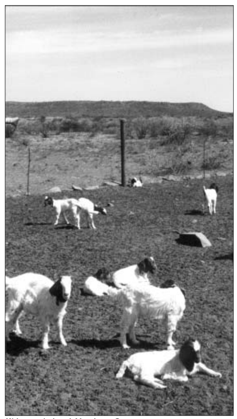
Kid goats in kraal, Northern Cape