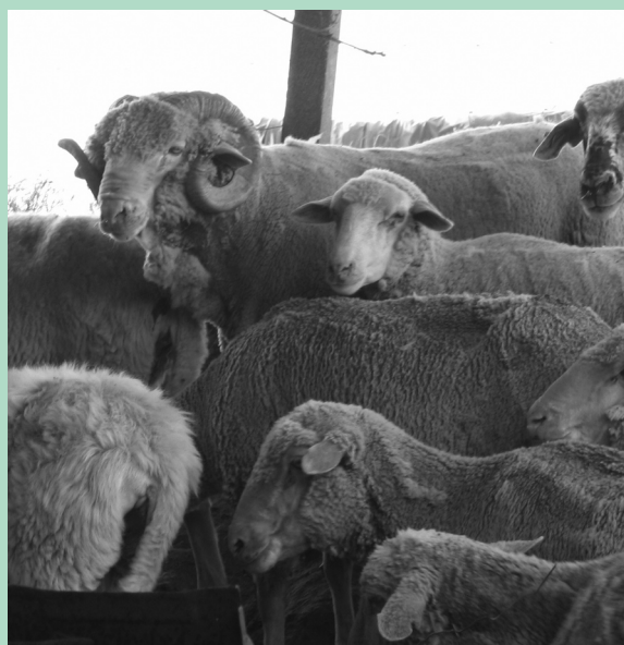
Sopravvissana sheep - in demand, but out of reach for farmers

But the herders need some kind of public support. "I can't make a gift of these sheep" they say. Which is true. The most productive sheep in Italy now - the Sarda - can give up to one litre of milk per day, while the Sopravvissana produces only one-fifth of a litre. The herders have made a conscious decision to keep the traditional sheep and they have a right to some kind of non-monetary compensation.