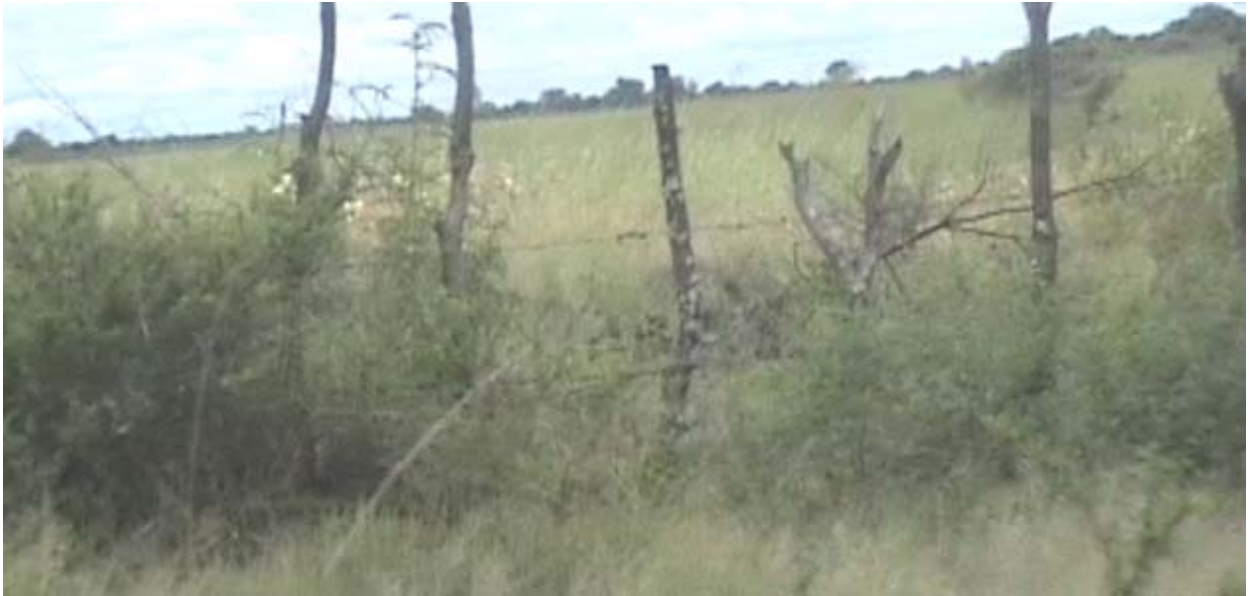
Photo three: tall grass waves in fallow fields where maize should be growing, in an ARDA-run irrigation scheme in Matabeleland (March 2006)