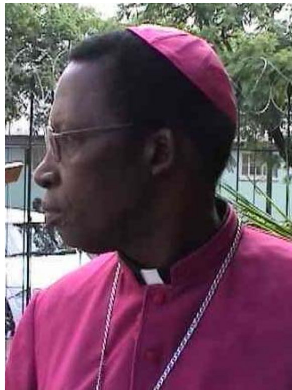
Archbishop Pius Ncube