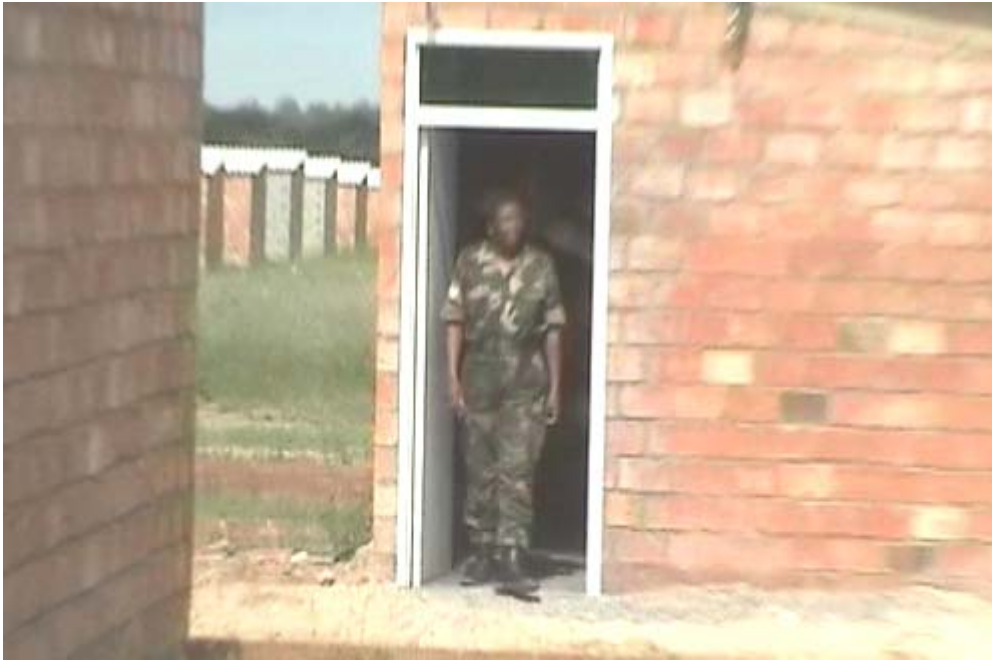
Photo two: soldier emerges from a newly allocated house in Cowdray Park, where 700 houses were built under Operation Garikai / Hlalani Kuhle, supposedly for the displaced.