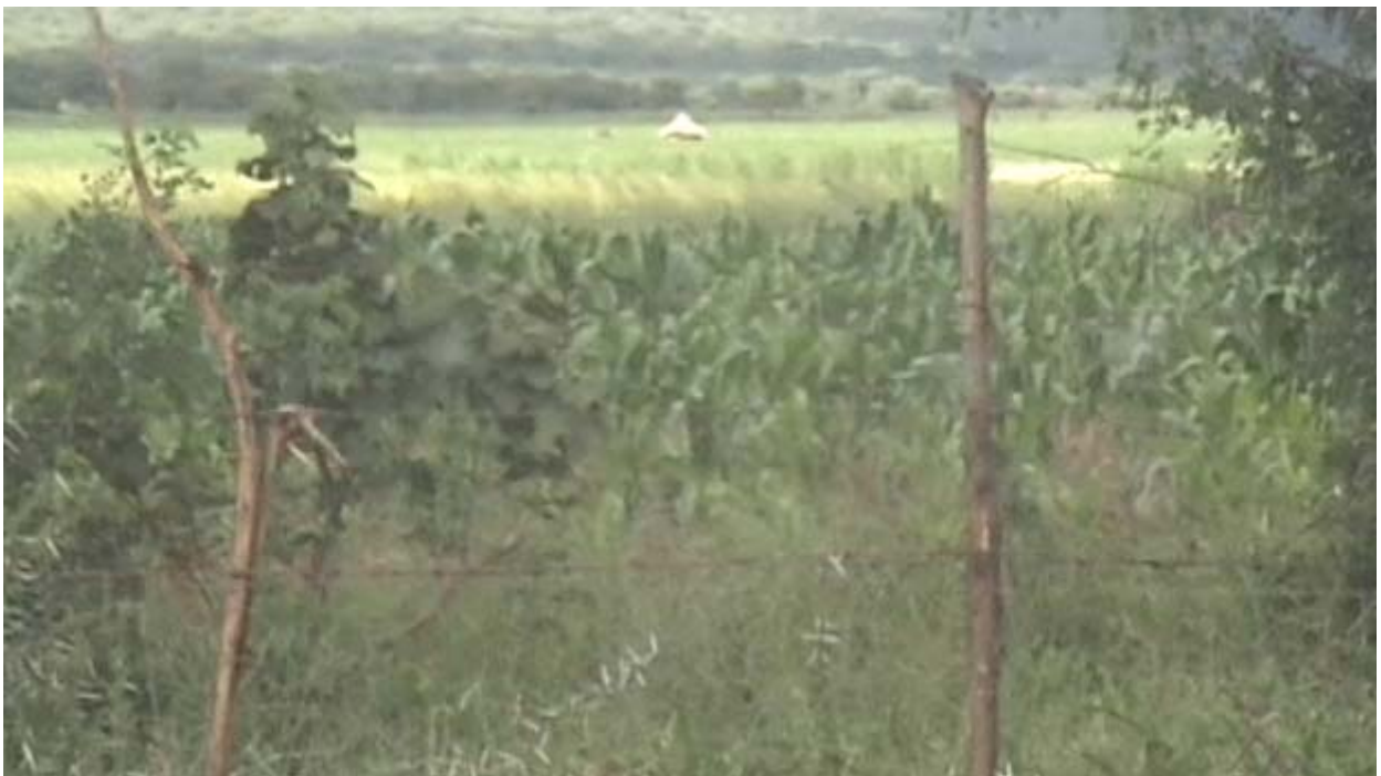
Photo four: late crops – and fallow fields in a different ARDA-run Matabeleland irrigation scheme (March 2006). Maize should be two metres high by March.