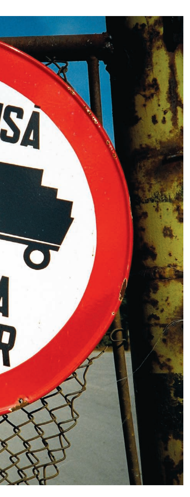
Left: 'No Parking' traffic sign aimed primarily at Roma vehicles in Sighisoara, Romania.