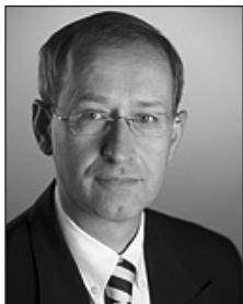
Mr. Michael Ambuhl Secretary of State of the Federal Department of Foreign Affairs of Switzerland

The session opened with a video message from the UN Secretary-General, Mr. Ban Ki-moon, the text of which is reproduced on page iii. Extracts from the keynote address by the Chair of the session, Mr. John Holmes, UN Under-Secretary-General for Humanitarian Affairs and Emergency Relief Coordinator, are provided on page v. Additional opening addresses were provided by guest speakers as follows.