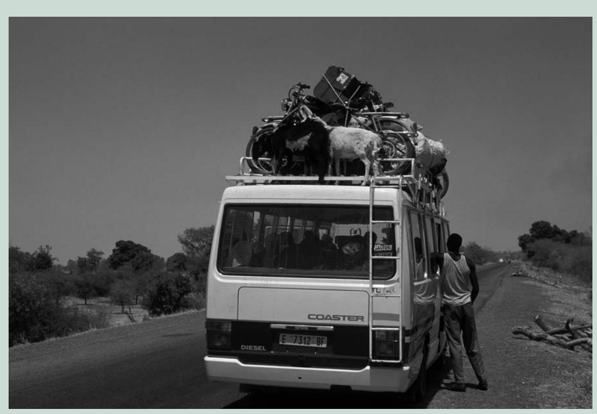
Minibus piled high with goods and animals, Burkina Faso.