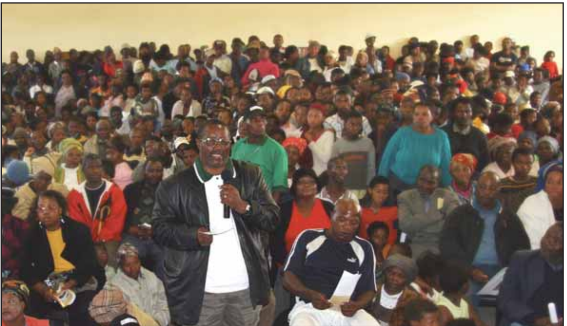
One of the Open Stakeholder Forums held during the CRM.