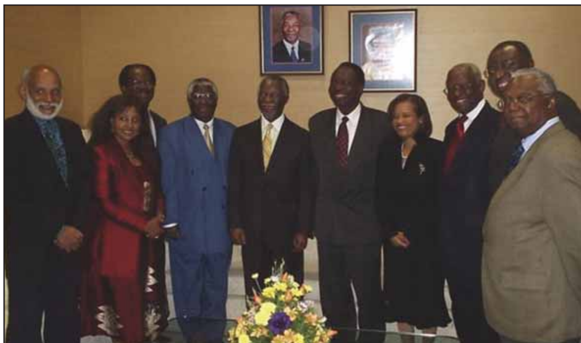
Members of the Country Review Mission, accompanied by Hon. Fraser-Moleketi, pay a courtesy call on President Thabo Mbeki.